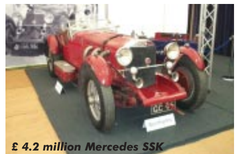
£ 4.2 million Mercedes SSK

This year the Goodwood Revival saw records broken not only on the track but also in the Auction Room. A crowded Bonhams Marquee saw a 1929 7.1 litre Mercedes SSK sports tourer sell for £4.2 million, setting a new record for the highest price ever paid for a motorcar in Europe. For those of us who don't appreciate patina ..... it needed restoring!